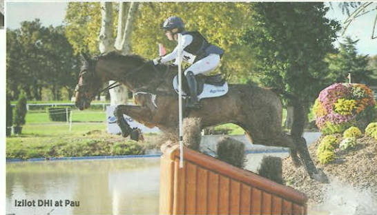
Izilot DHI at Pau