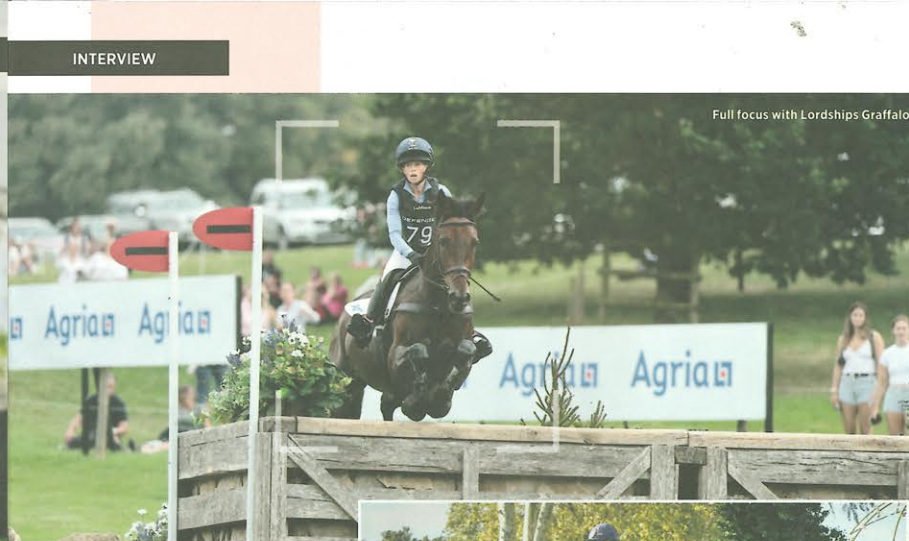
Full focus with Lordships Graffalo