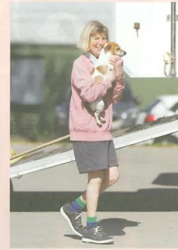
Izilot DHI at Lumühlen